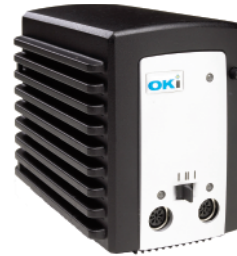
MFR-PS2200 Dual Simultaneous Output Soldering & Rework