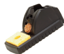
MFR-WSSR Non Sleeper Workstand