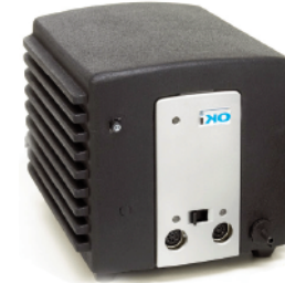
MFR-PS2X Switched Two-Port Solder / Desolder with External Air