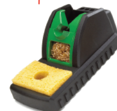
WS1G Green Auto Sleep Workstand