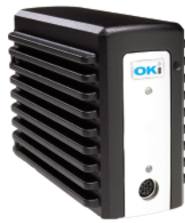
MFR-PS1100 Single Output Soldering & Rework