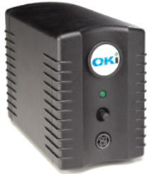
PS-PW900 Production Soldering