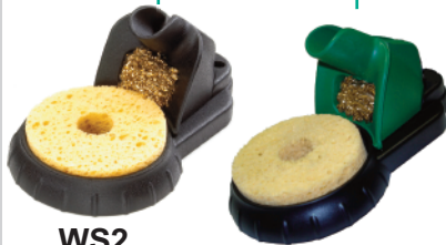
WS2 Auto Sleep Workstand WS2-NS Non Sleeper version WS2G Green Auto Sleep Workstand