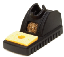
MFR-WSDS Non Sleeper Workstand