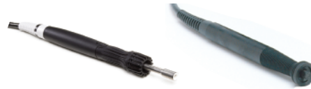
MFR-H2-ST Includes MFR-CA2 coil