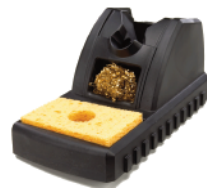
WS1 Auto Sleep Workstand