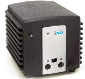
MFR-PS2K Switched Two-Port Solder / Desolder with Internal Air Pump