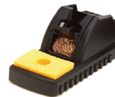
MFR-WSPT Non Sleeper Workstand