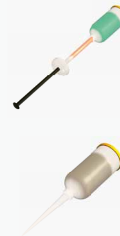
Injection Cartridge Kit