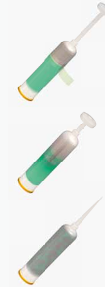
Barrier Cartridge Kit