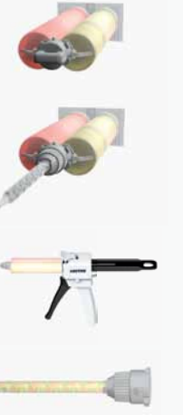
Dual Cartridge / Static Mixer Kit